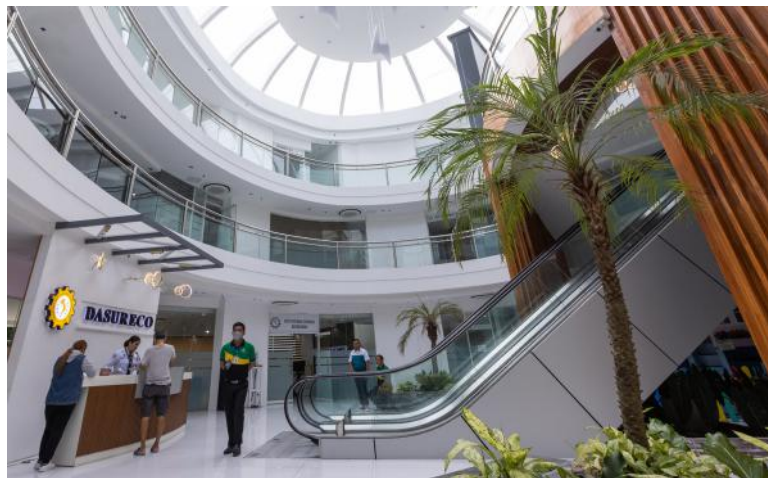
Davao del Sur Electric Cooperative (DASURECO) is one of the cooperatives that availed of the ANTI-BILL SHOCK Program in 2023. As a public utility provider, DASURECO is a partner in the National Government’s Rural Electrification Program, particularly in the provinces of Davao del Sur and Davao Occidental. The cooperative services many small farmers and fishers and supports their capacity for post-production and storage.

PROGRAMS MANAGEMENT DEPARTMENT II 27th Floor, LANDBANK Plaza, 1598 M.H. del Pilar corner Dr. J. Quintos Sts., Malate, Manila Tel. No. (+632) 8405-7450 Fax No. (02) 8528-8542