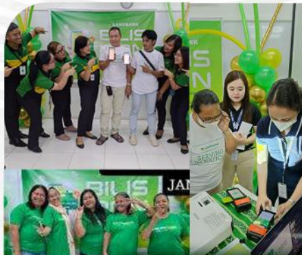
Cagayan de Oro City, Misamis Oriental