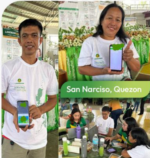
San Narciso, Quezon