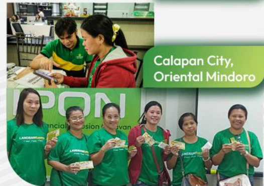
Calapan City, Oriental Mindoro