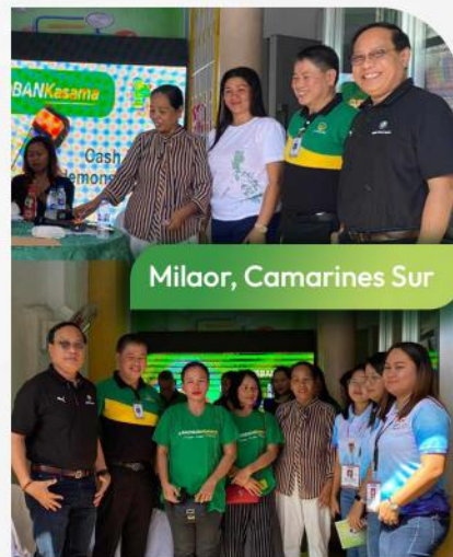
Milaor, Camarines Sur