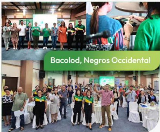
Bacolod, Negros Occidental